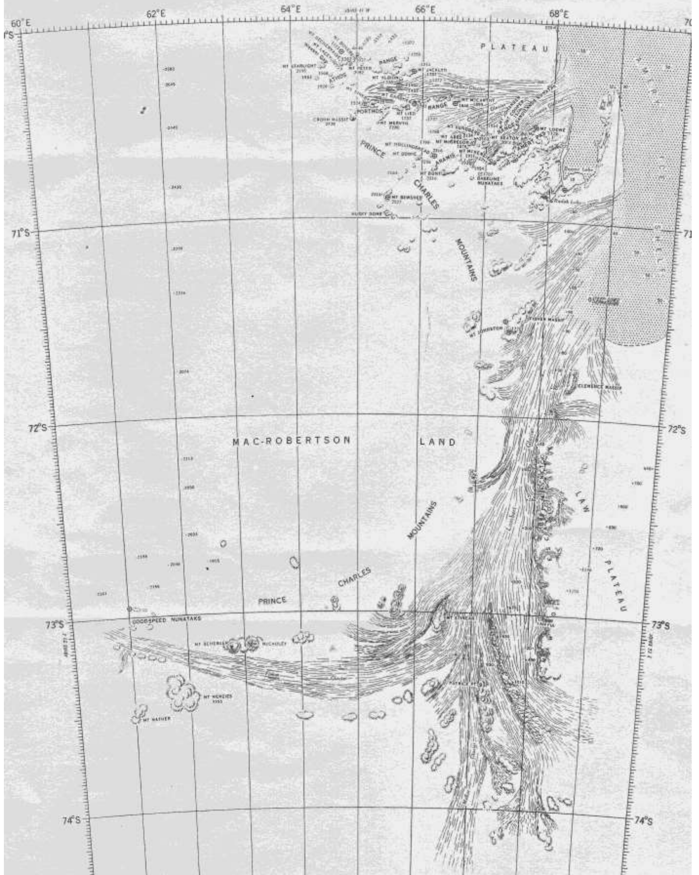
Figure 2 : First map of the Prince Charles Mountains (Division of National Mapping 1957)