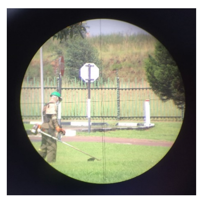
Figure 14. The alignment error factor

The following photograph illustrates the alignment error over a short distance. The cross hairs of the total station are focused over the control beacon. It clearly illustrates the error in alignment between the optical centre of the total station and that of the gyro attachment.