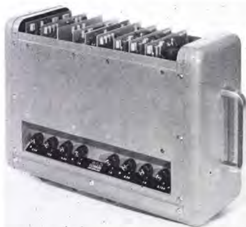
FIG. 5. Circuitry Unit (cover removed)

cut from the roll for observation under a suitable stereoscope.