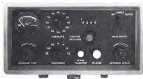
FIG. 6. RC10 Control Unit

The electrical equipment of the camera operates on 24–28 volts dc. All elements with control functions are transistorized and are accommodated in two separate housings, the Circuitry Unit and the Control Unit. Only