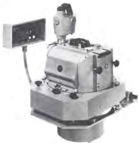
FIG. 1. The RC10 Universal Film Camera

This universal aerial camera uses pan, IR, color, and false-color films, has interchangeable wide-angle or super-wide angle cones, large film capacity, short cycle time, transistors, remote control, etc.