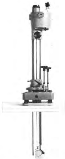
FIG. 7. Wild NF2 Navigation Sight

such components are used which satisfy the rigorous military specifications. The electrical system is subdivided into different control circuits with regard to their specific functions. For the basic RC10 version, the Circuitry Unit contains six plug-in boards (with printed circuits) which can easily be exchanged and checked. In the housing there is space for four more boards. Three additional boards are needed for remote control of tip, tilt and drift in connection with the NF2 Navigation Sight. The Circuitry Unit is in a way the central electrical part of the camera. It also contains the fuses. All cable connections are also made here to and from the auxiliary equipment that might be used with the RC10. As power is transmitted from