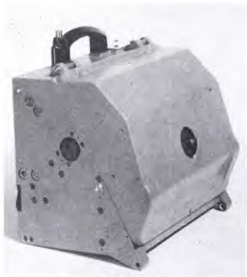
FIG. 3. RC10 Half Cassettes

to calibrated focal length is less than 10 microns. The light fall-off follows closely a curve of cosine to the power of 2.9 of the half-field angle, and is corrected by antivignetting coating on the filters.