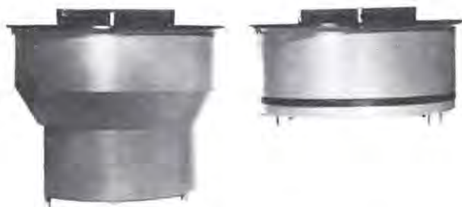
FIG. 2. Universal-Aviogon and Super-Aviogon II Lens Cones

The Super-Aviogon II lens is an entirely new design by L. Bertele. It was completed in 1968 and has only superficial similarity with its predecessor, invented in 1956. The new lens is in all optical aspects comparable with the Universal-Aviogon but has, at 120^\circ , a larger field angle and even a slightly higher resolving power in terms of angular resolution. The Super-Aviogon II lens is fully color-corrected and can therefore be used in connection with the proper filters for panchromatic, infrared, color and false-color photography. More about this new lens will be reported in a separate publication in the next few months, but it should be mentioned briefly here that the maximum resolution measured on axis was 115 lines per mm and the minimum not less than 20 lines per mm at 60^\circ . The average radial distortion referred