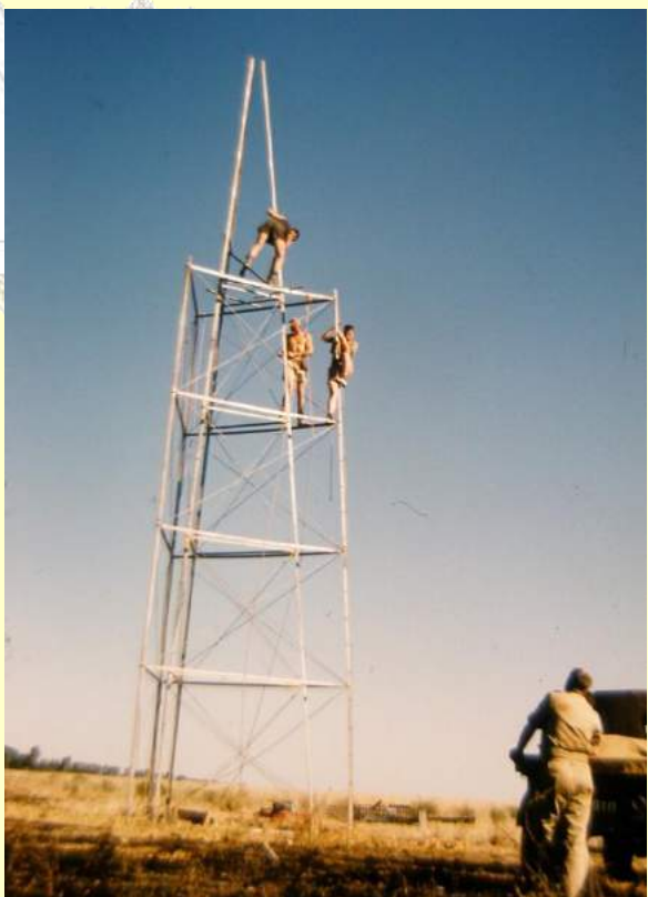
The inner tower frame above the survey mark was for the theodolite and tellurometer and the outer to support the observing platform