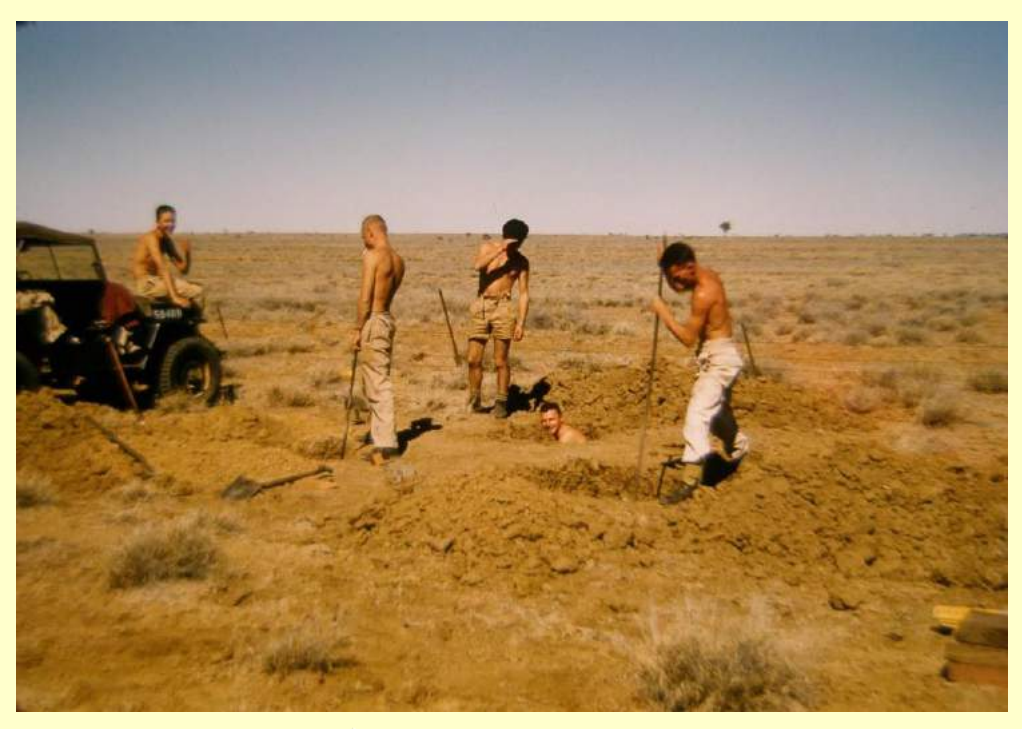
Digging the foundations