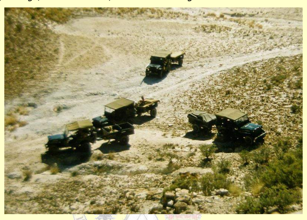
Topo Sqn vehicles with trailers all the way from Bendigo VIC more than 2,700 km away. Are they Austin Champs which I have been told were on issue to Topo Sqn and replaced by Landrover Series 2 in 1960, or Ford Jeep?

Editor: From the 1958 First Order geodetic traverse by theodolite and tellurometer (MRA1) from Charters Towers QLD to Tennant Creek NT - Topographic Squadron AHQ Survey Regiment, Bendigo, VIC. Traverse 1,637 km establishing 62 stations.